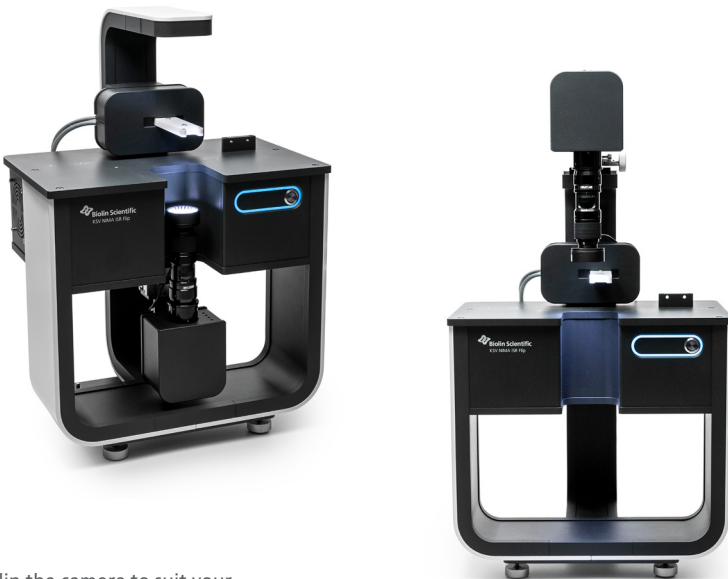
Flip the camera to suit your specific research conditions.

Invest in a versatile tool to analyze foam and emulsion stability, and characterize proteins and surfactants. Combining ISR Flip with our KSV NIMA Langmuir Trough system gives you a unique possibility to control the monolayer packing density and surface pressure while measuring.